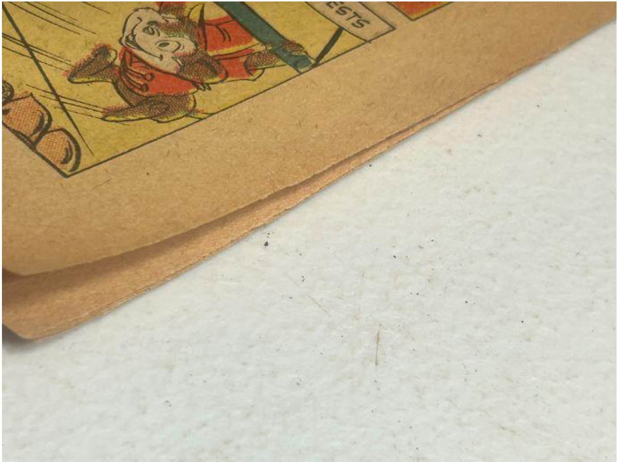
Image shows a single interior page lifted above flat underlying pages.