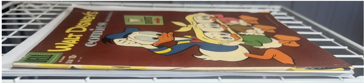
Image is sharp and well lit, showing the full spine length.