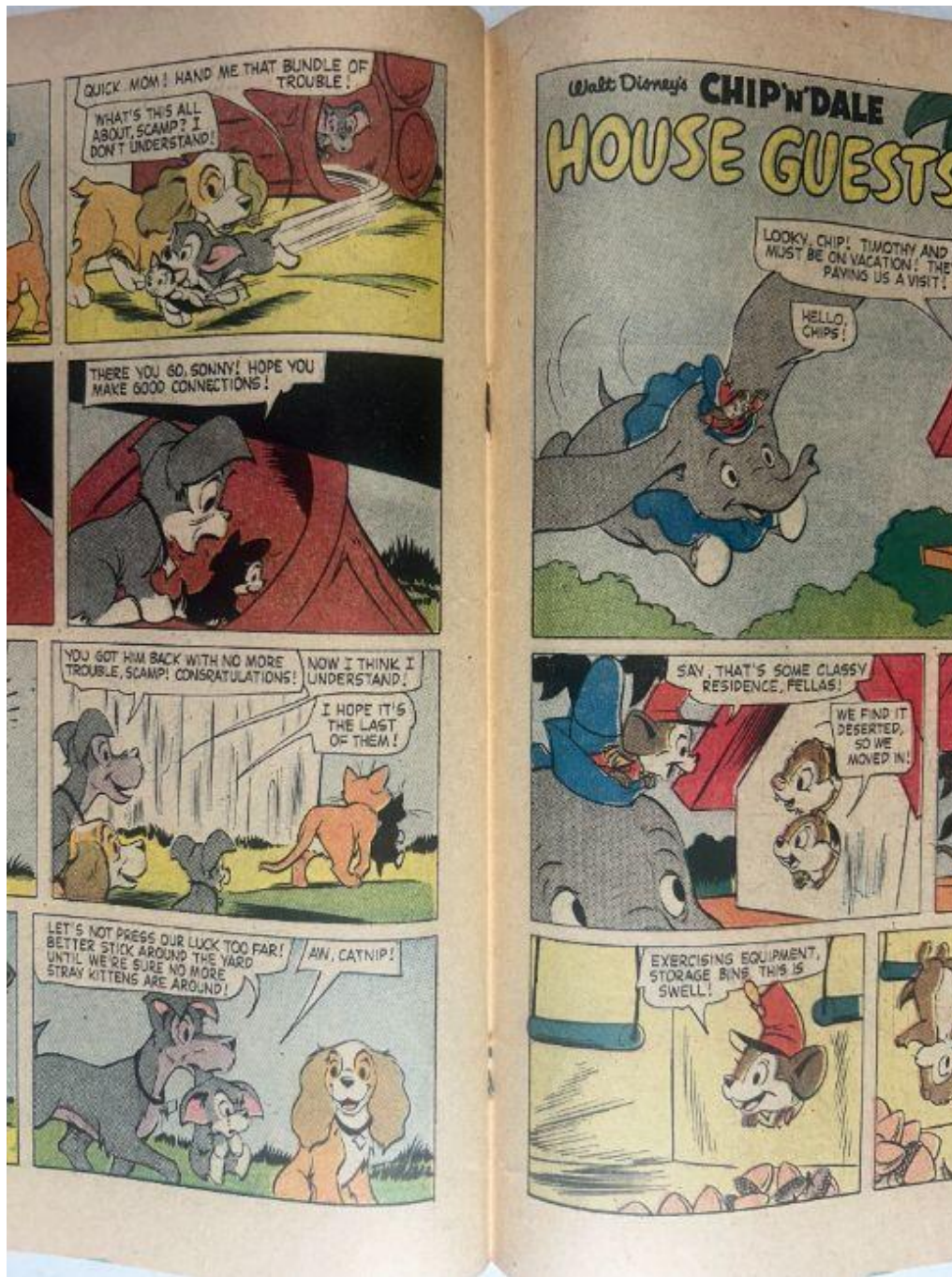
Image is in focus and evenly lit, clearly showing both pages and the central gutter.